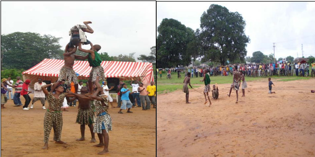
Acrobats involved in community out reach as a mobilization strategy

MEDA has involved an Acrobat group as a new tool in community outreaches apart from the other existing tools such as Magnet theatre, Pupeteers, MWAFO (Ambassadors of Hope). Video Projector and Mahewa. Two of the six Acrobats members are trained AOC’s. They have been attracting a good number of audience in mobilization since they are acting as a facelift to the whole process of mobilization.